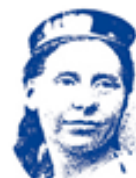
Olafia Johannesdottir 1863 – 1923

Seksjonen er senter for rådgivning, undersøkelse og behandling av seksuelt overførbare infeksjoner