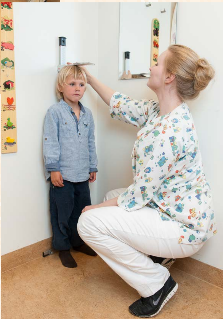
The nurse measures how tall he is.