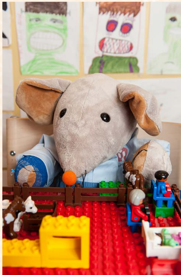
The playroom has many toys and it is fun there.